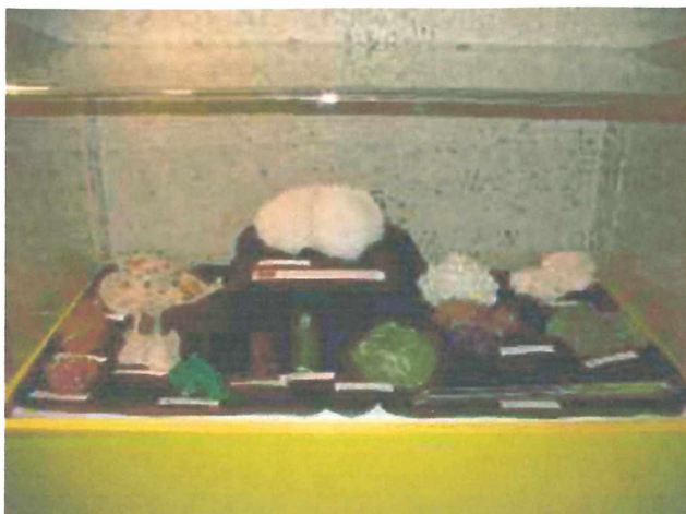
Stunning minerals from around the world were Displayed at the seminar