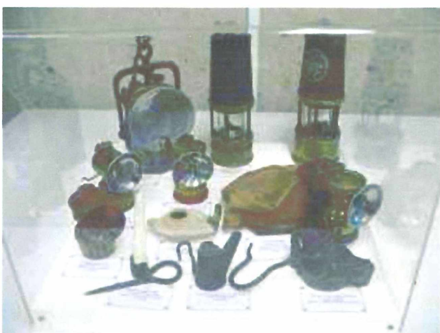
Collection of miners lamps adds depth to Tony Forsyth's presentation