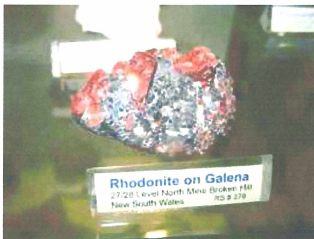
Rhodonite from North Mine, Broken Hill, NSW, On display at the Minerals Heritage Museum.