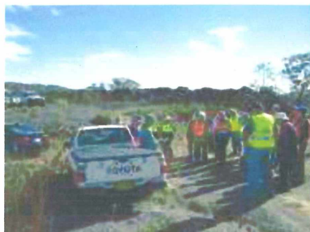
Russel Kanowski holds a safety Briefing and induction at the Toowoomba pilot tunnel Collecting site.