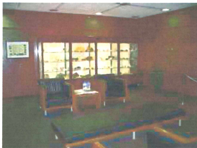
Mineral Heritage Museum display cases in the Foyer of 61 Mary Street, Brisbane.