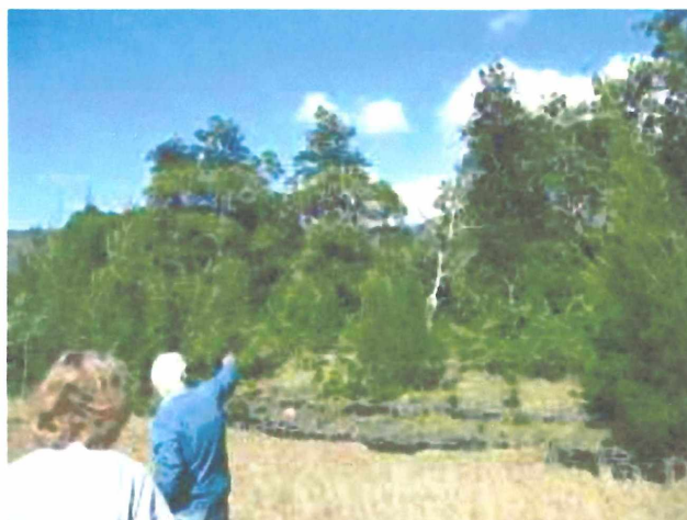
View towards picturesque Laidley Creek. The basalt boulders in the creek bed contained A sparkling array of micro zeolites.