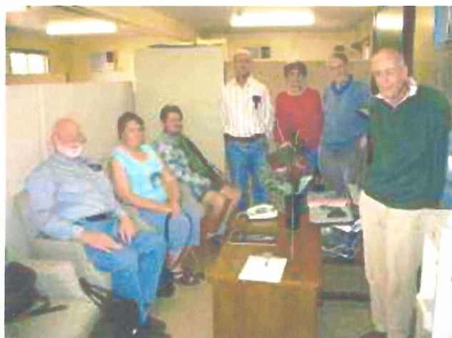
Field Trip Friday June 5 2009 Delegates awaiting JKMRc tour.