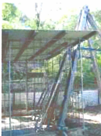
Shaft at the University of Queensland Experimental Mine