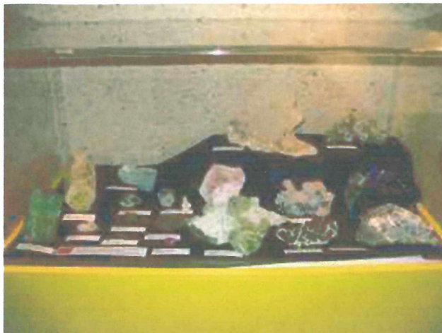
Seminar mineral display case with many beryllium species.