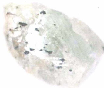
Hydroxylherderite ( \text{CaBePO}_4\text{OH} ) from Brazil