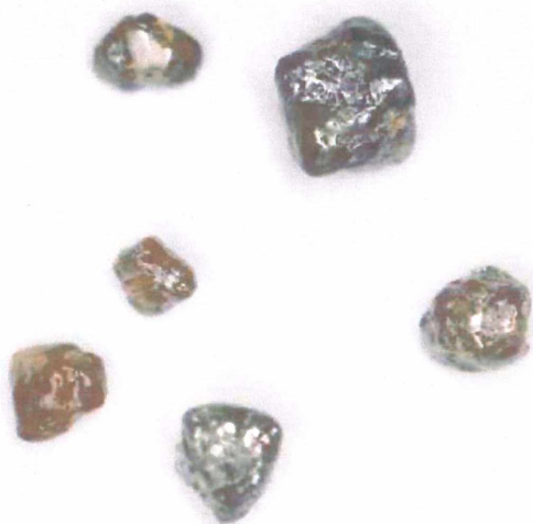
Small inexpensive diamonds ranging in price from $5 to $20 These were purchased earlier this year from a shop in Fremantle.