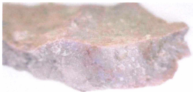
Purple Jadeite ( \text{Na}(\text{Al},\text{Fe})\text{Si}_2\text{O}_6 ) from Turkey

The purple jadeite was brought along to show that not all jadeite is green.