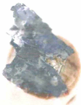
Lengenbachite ( \text{Pb}_6(\text{Ag},\text{Cu})_2\text{As}_4\text{S}_{13} ) from Switzerland