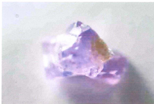
Purple Fluorapatite from Pulsifer Quarry Maine, USA

Lengenbachite is one of the few minerals that contain both lead and silver.