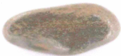
Bahianite ( \text{Al}_5\text{Sb}_3\text{O}_{14}(\text{OH})_2 ) from Brazil

The following photos show just a few of the minerals that members examined.