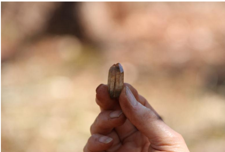
A typical 25mm twinned, terminated quartz crystal from Toodyay.