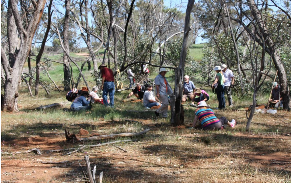
Group of enthusiastic ‘fossickers’ searching for quartz crystals.