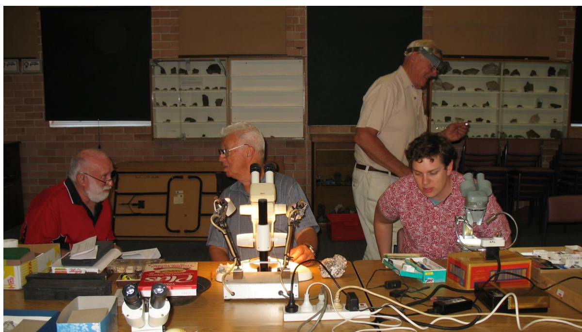
Figure 2: Our highly esteemed editor (right) clearly not working on an article as he said he would.

All in all, an excellent end to the year!